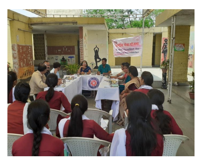
was highly appreciated in this meeting